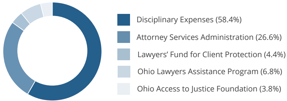
Figure 2 — Fiscal Year 2022 Allocations